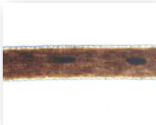
B) Medulla of hairs of Hylobates hoolock X400